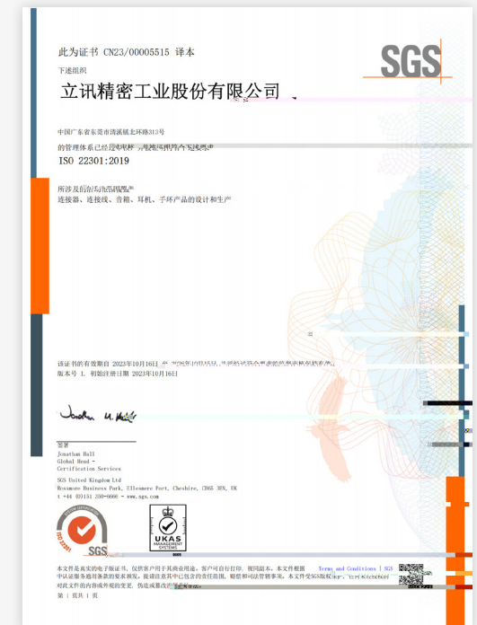
ISO 22301 Business Continuity Certificate

After undergoing a rigorous review, the Company was successfully certified by ISO 22301 for business continuity, providing a robust guarantee for the Company's steady operations.